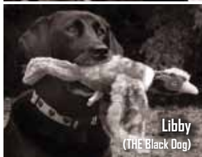
Libby (THE Black Dog)

Back in 2005, Kurt and Martha Forgy (“For-jay”) created Black Dog Cycle Works to feed their addiction for adventure riding. Today, BDCW ’s famous brand of American made adventure motorcycling products are used and abused by riders WORLDWIDE —including many of the top names in the industry.