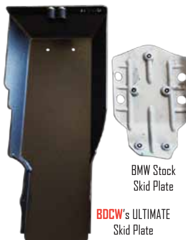
BMW Stock Skid Plate