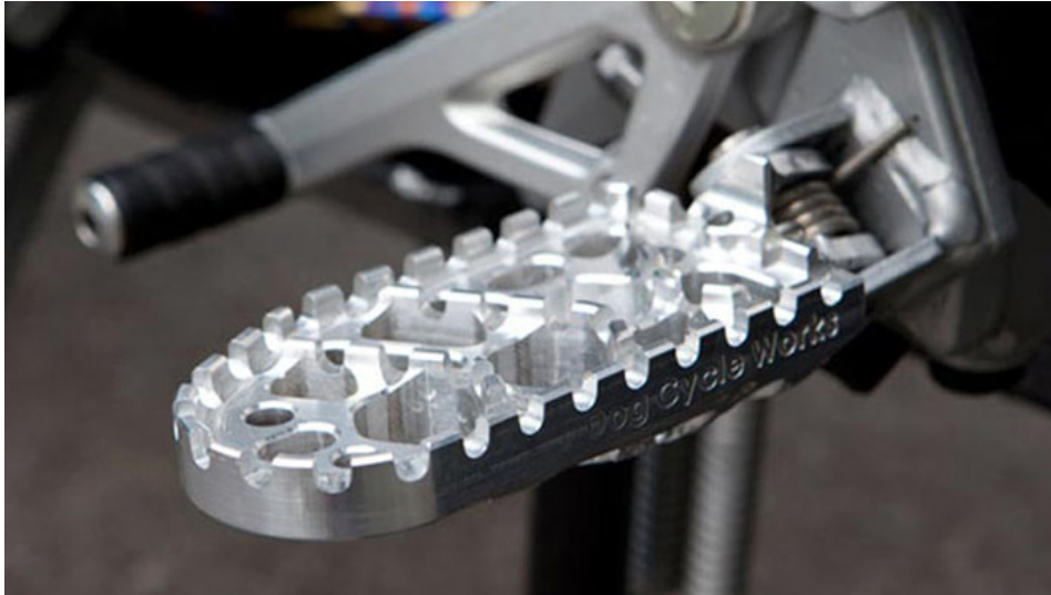
The increased leverage of the wide platform footpeg design gives the feeling of power steering when steering with your feet off-road. Available for KTM , BMW and Triumph Adventure Bikes.

Included in the package are new springs, an installation pin and clear instructions, which allowed us to switch the pegs in about 10 minutes. During the installation, we discovered there are subtle differences between the Black Dog springs and the stock ones, so be sure to use the supplied springs when installing the pegs.