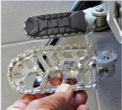
BDCW Platform Footpegs compared to the small stock BMW R1200GS footpegs, which have a rubber insert.