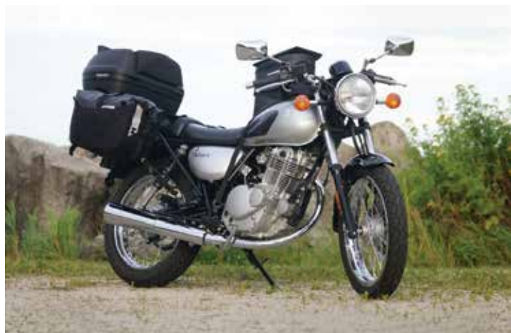
The Enduristan bags blended quite nicely with the TU.

To read about how the bags mounted up, click here .