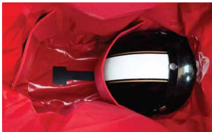
Here's the inside of the Monsoon saddlebag. Note the Velcroed separators and the handle at the bottom that easily allows you to turn the bag inside out for cleaning purposes.

There are two Velcroed panels inside each bag that can be used as separators for your kit, or they can simply be pushed against the front and back of the bags to give you one large open space.