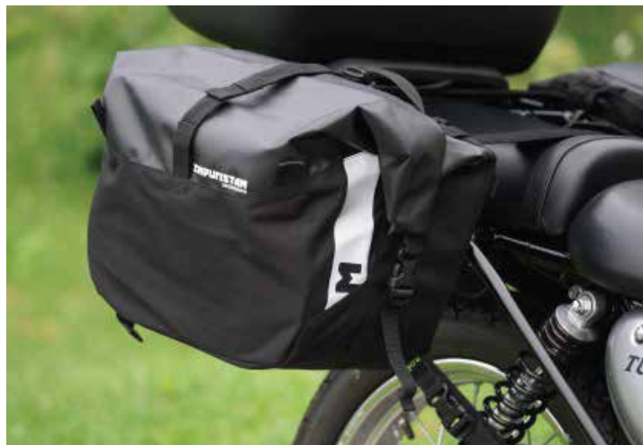
There was nothing in these bags when I took this shot, yet they hold their form.

There's a plastic panel that slides into a channel between the outer bag and inner liner and it wraps around the front, underneath and to the rear of the bag. It's high-impact plastic that will help to protect the contents of the bags from thrown-up stones or branches, if you are riding off road.